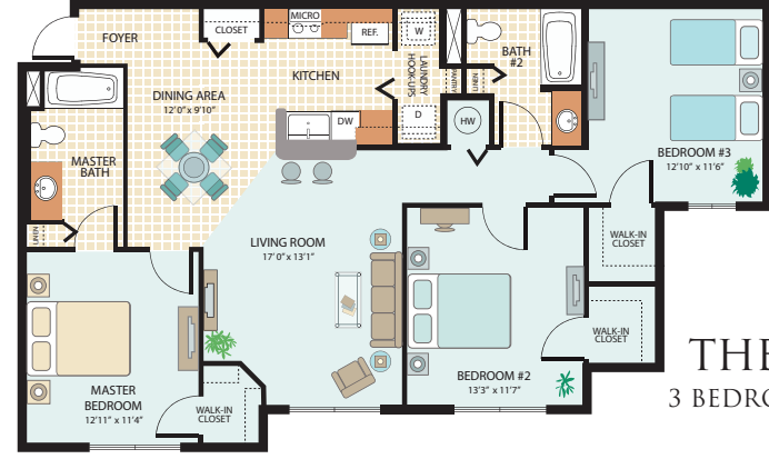
THE CYPRESS 3 BEDROOM - 1240 SQ. FT.