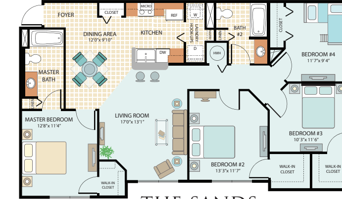
THE SANDS 4 BEDROOM - 1364 SQ. FT.

Dimensions and square footage are approximate, variations may occur in some floor plans. All amenities are subject to change.